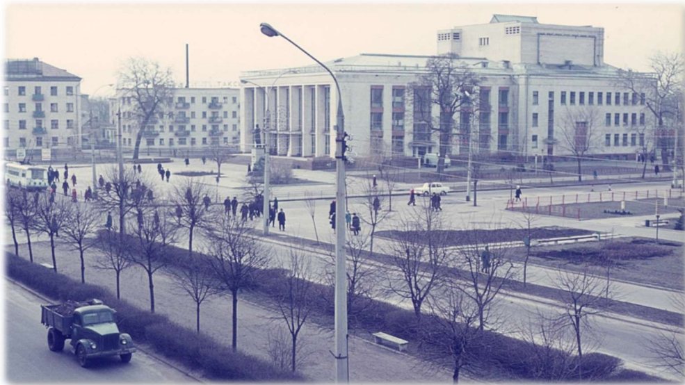
View of Cherkasy center from our hotel room.

We found out later that there are two hotels named “Hotel Cherkasy” (Отель Черкаси). One is an Intourist hotel, which is probably where our real reservation was. The second is a standard Russian hotel, which is where we are. I guess that since I spoke Russian with the taxi driver and asked that he take us to “Hotel Cherkasy,” he must have assumed that I was from one of the Soviet bloc countries — with my accent he certainly wouldn’t have assumed that I was Russian — and took us to the Russian hotel rather than the Intourist hotel. An interesting development, but one that turned out to be fun and to our benefit.