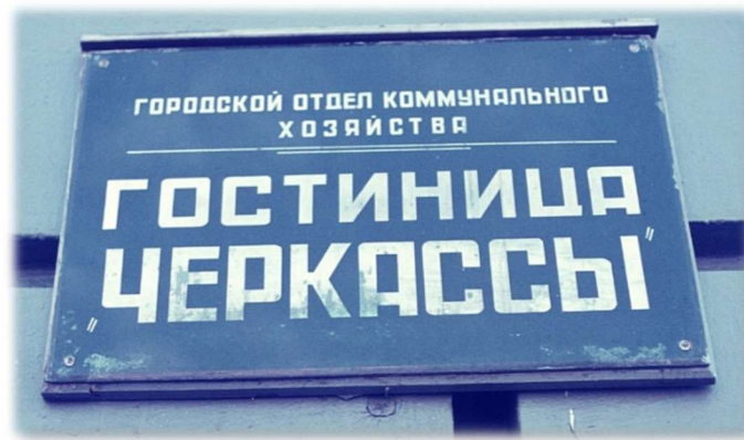
Hotel "Cherkasy" — "City Department of Municipal Authority."

We are in a real Russian hotel — as opposed to an Intourist hotel, which is for foreigners — in a luxurious room for just 12 rubles (about $15) per night. There is no restaurant in this hotel, but there are many cafes on the street.