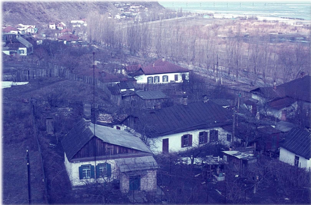
Shots of the neighborhood and Dneiper River near Bubba's house.

We walked about 5 miles along the Dneiper River taking pictures. It was a beautiful day. Balin said that there used to be dwellings on the river side of Gagarin Street, but there is nothing there now. I shot two full rolls there, and that will tell the story.