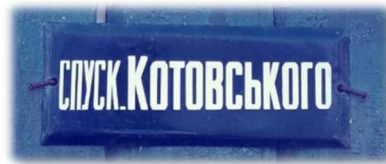
Street sign identifying the modern name of the street where Bubba's house is located.

A large hill rises behind the houses. I forget the name of the street now, but I photographed the sign. ["Lower Kotovskovo."] We tried to find out who lives in the house now, but it was well isolated by fences and didn't look friendly. Smoke rose from the chimney.