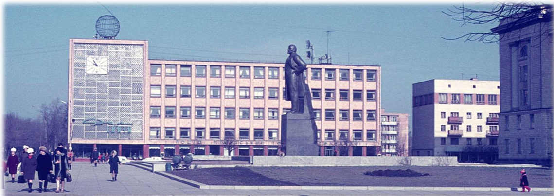
Central Cherkasy square with statue of Lenin.