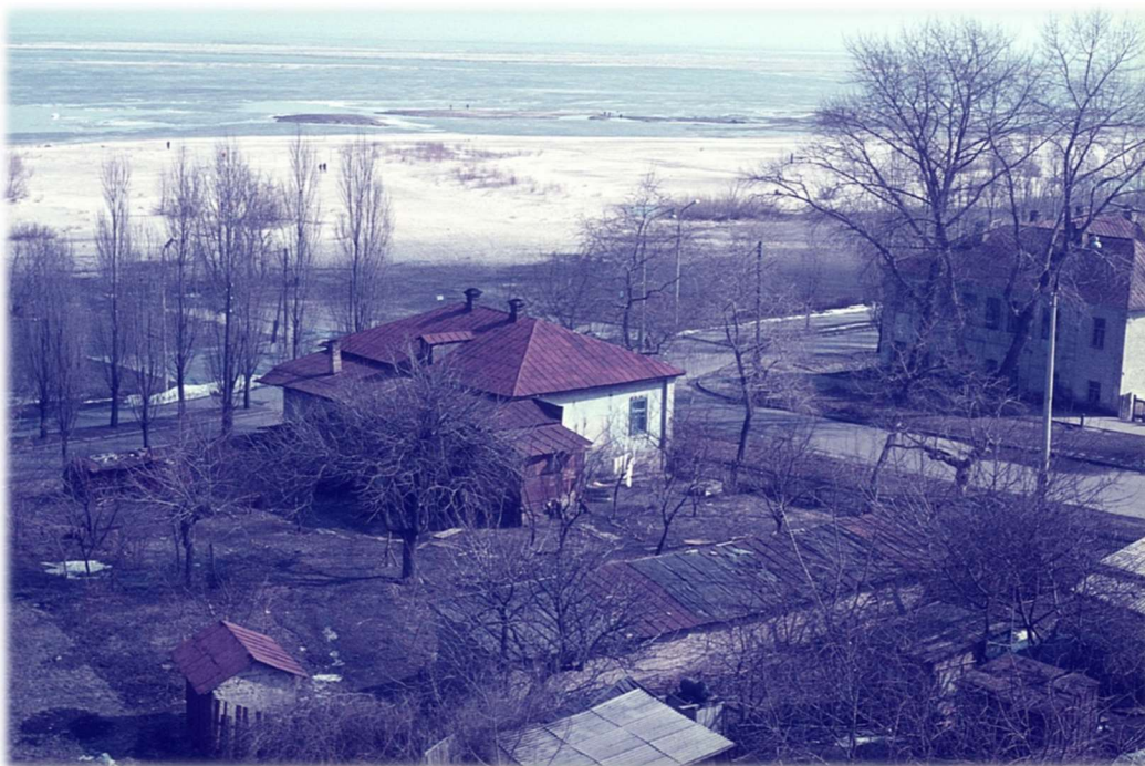
Shots of the neighborhood and Dneiper River near Bubba's house.

The rest is anticlimactic history: losing our plane tickets and buying new ones, searching for maps of Cherkasy that don't exist, learning that Cherkasy is now a city of 150,000 people, buying souvenirs, getting to the Kiev airport just in time, and falling asleep on the plane back to Moscow.