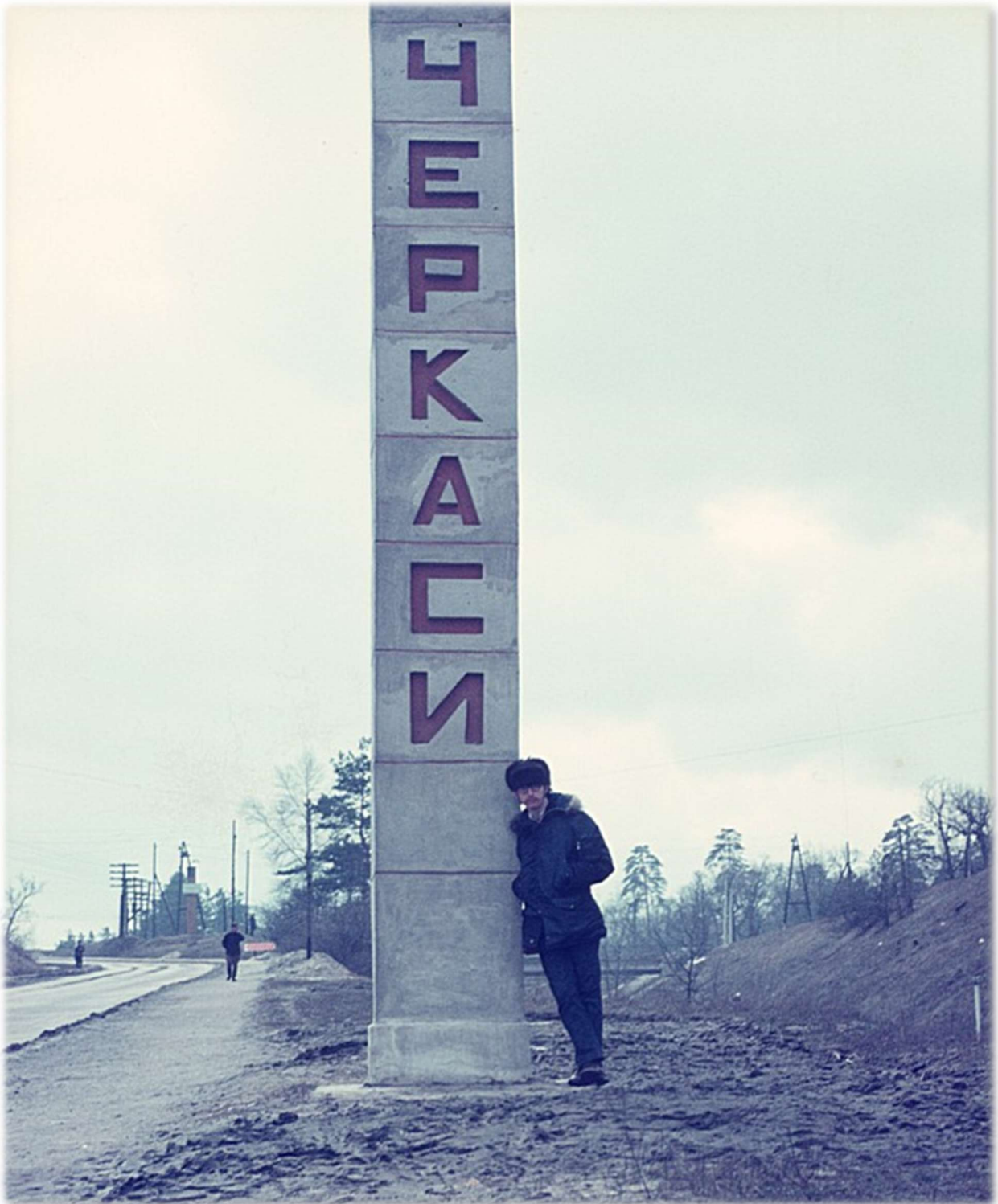
Jesse at the sign on the main road into Cherkasy.