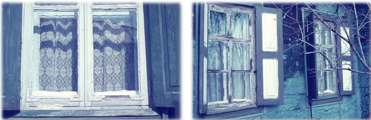
Windows in old buildings.

I took a lot of images of old dwellings. I saw a building that looked like it may have been a synagogue and shot it, walking on private property. A young woman who lives there was working in the yard and was very nice to me. She called the dogs away from me and didn't question my presence at all. I asked her if the building used to be a synagogue, but she said no. She told me where there used to be one and I looked for it, but it must have been demolished because there was no outstanding building. I saw a lot of interesting dwellings, but I am interested to see the exact buildings where Bubba lived tomorrow.