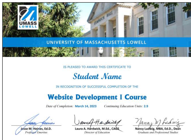
Fig. 5. Course completion certificate.

Doing SETs in the middle of a course allows you to gather formative information that is actually actionable. That is, with half the course remaining you have time to address problems identified by current students in the current class. Doing SETs at the end of a course may guide you to improving the course the next time you teach it, but that’s of no value to your current students.