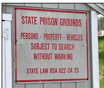
Fig. 2. Parking lot welcoming sign.