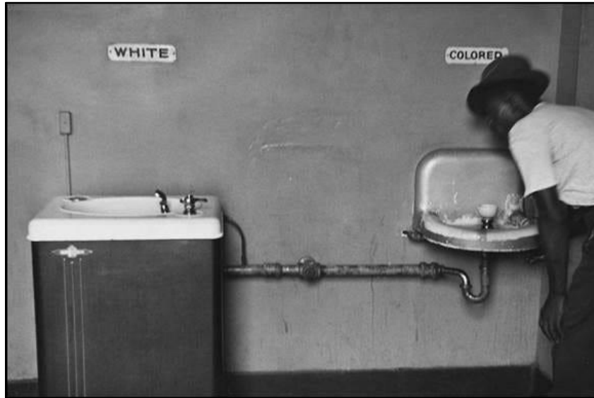
A photograph by Elliott Erwitt depicts segregated drinking fountains. The photo is featured in "Civil Rights: A History," created by Jesse Heines of Chelmsford, with Bob Pariseau and Chelmsford Telemedia. Courtesy Photo.

The series is linked to the page of the Diversity, Racial Equity and Inclusion Committee , and is also available on YouTube and at Chelmsford Telemedia.